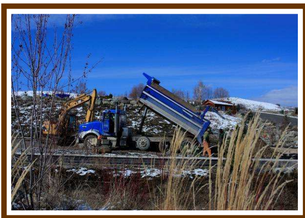
Working during the winter months to ensure completion by spring 2010

We have been busy during the winter months preparing the resort to ensure that everything is all set for the new season. New phenomenal view lots are being completed along the entire front row. Each lot combines a level of privacy with wonderful views of the surrounding vista. We are certain these lots will become some of our most desirable lots in the resort.