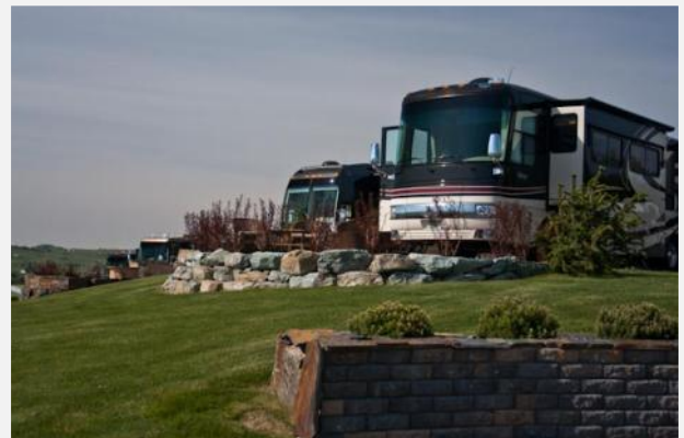
Memorial Day Coaches enjoying the view.