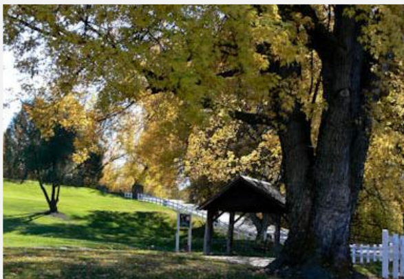
Tee box for Hole #5 on the Old Nine.