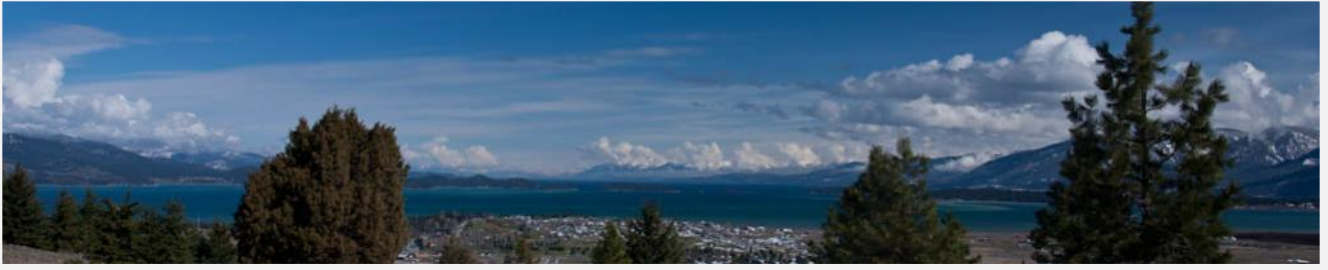
Overlooking Polson and Flathead Lake from the south.