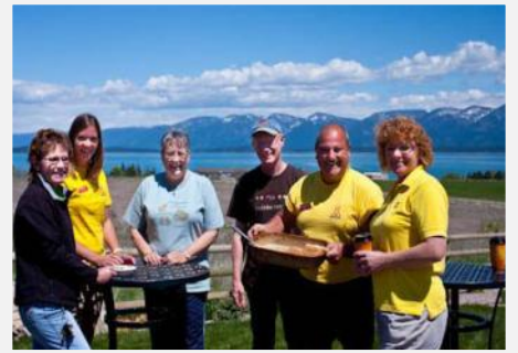
New staff for 2011. Not a bad place for a staff meeting!

Also new this year are thick, warm Denali blankets, and Ellington Bags that double for a purse/hiking pack. We have a large variety of huckleberry products and a brand new line of