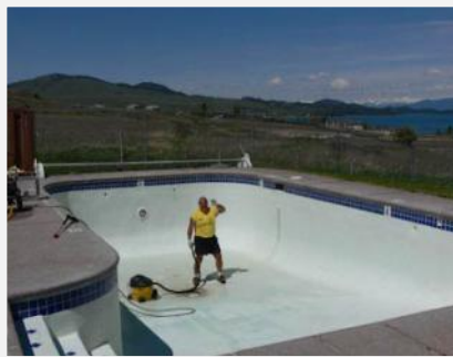
Bob cleaning the pool.

Our staff are all excited to be here in Montana and looking forward to serving you. We want to make your stay a memorable one that you will share with friends you meet along the way.