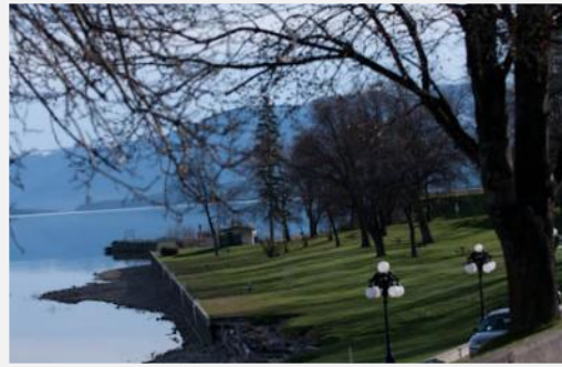
Sacajawea Park in Polson

http://www.polsonchamber.com/events_sep.asp