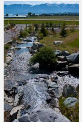
Resort waterfall feature.

Our brand new espresso stand is open and ready to take your order.