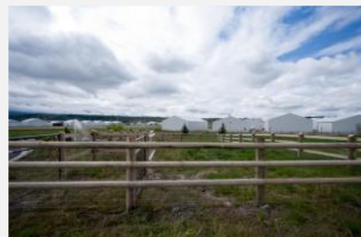
New Dog Run

Our stuffed animals this year are cuter than ever. Just the thing for the