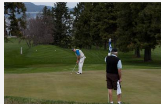
Polson Bay Golf Course