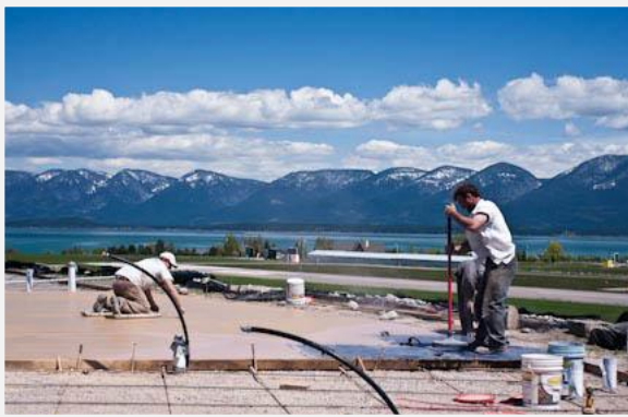
Workers laying down a stamped concrete pad.

Spring is in full swing at the Resort and there is lots of activity underway. We're cleaning the pool, trimming the