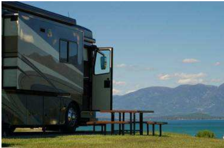
A nice site to rent