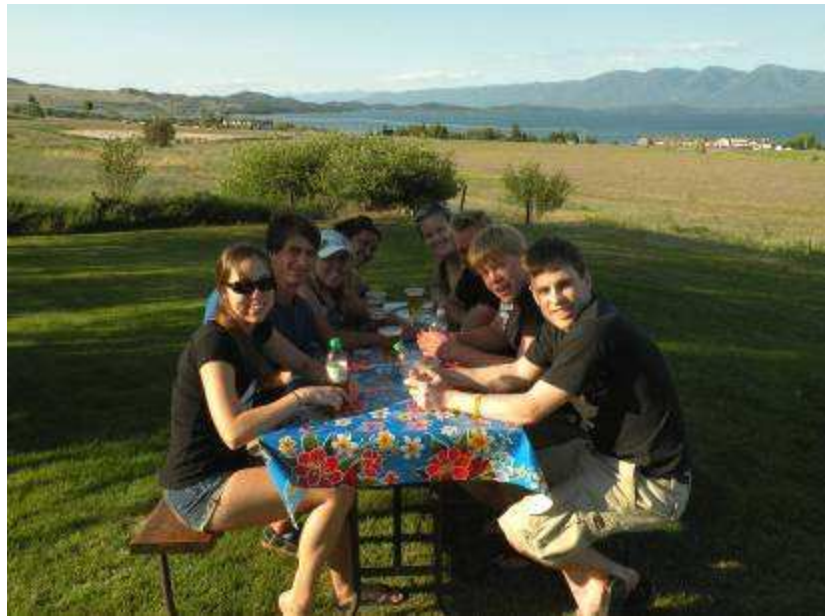
A great place for a picnic!