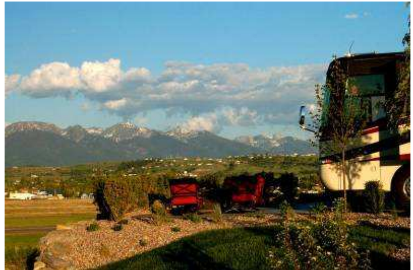
Front row seating!