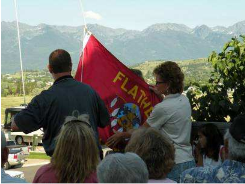
Raising the Flathead Nation - Salish / Kootenai tribal flag.