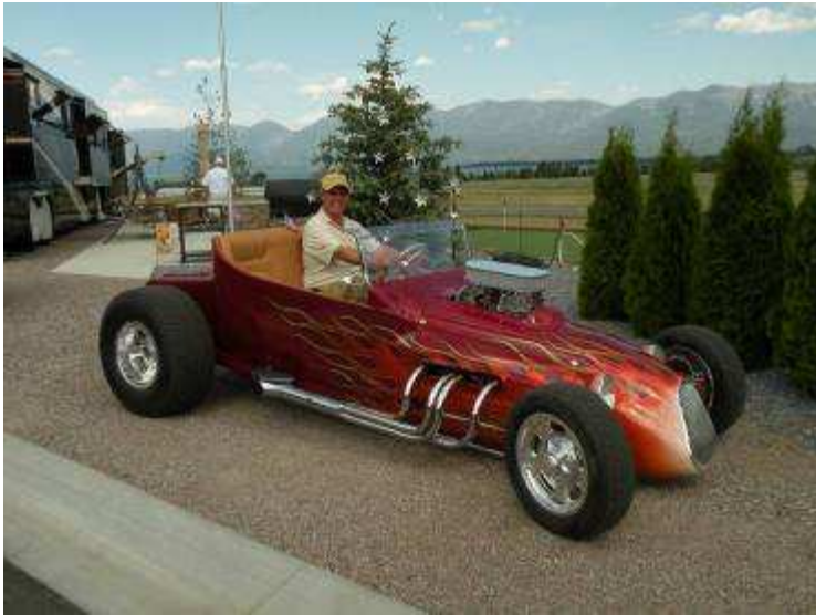
Award winning car!