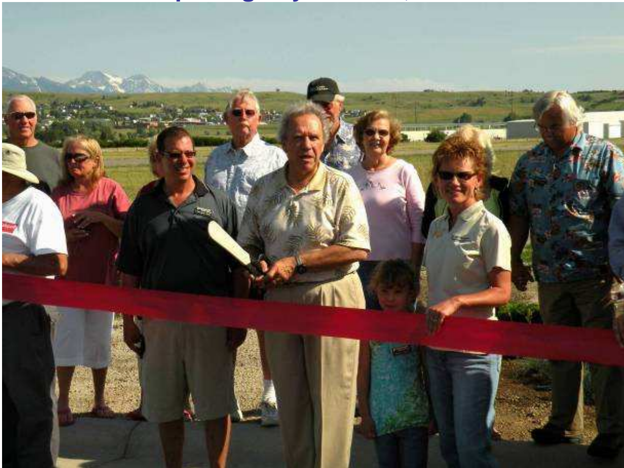
Official ribbon cutting ceremony