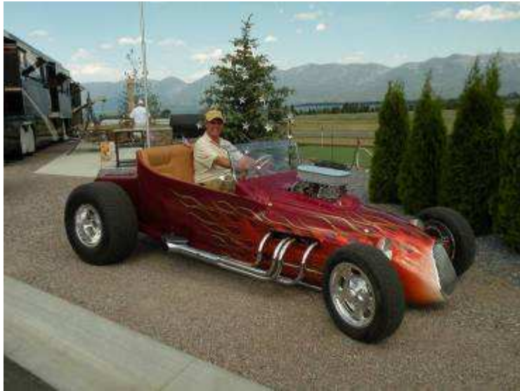
Award winning car!